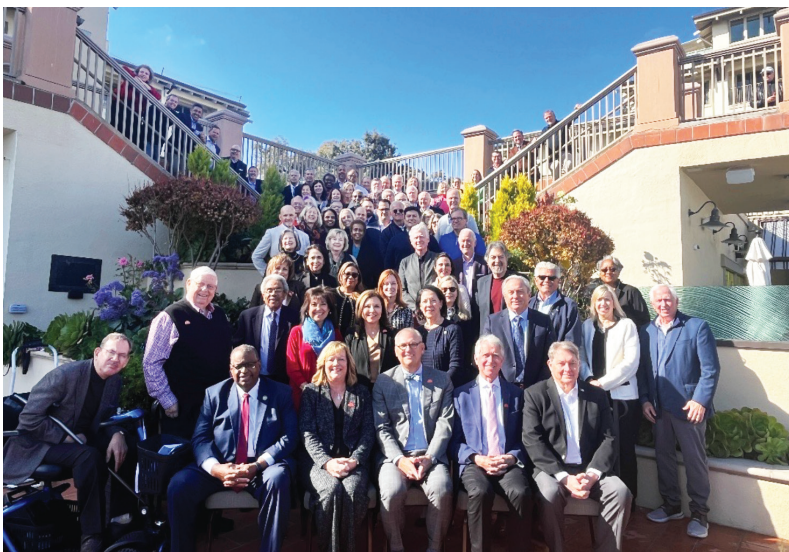
2025 California Conference Attendees