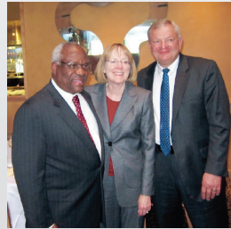
Justices Sandra Day O'Connor, Clarence Thomas, Stephen Breyer, and Samuel Alito have attended conferences.

When available, Justices from the United States Supreme Court and Chief Justices from our State Supreme Courts join us as speakers and at our receptions.