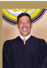
–Hon. Gregory Wells Appellate Court of Maryland