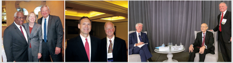
Justices Sandra Day O'Connor, Clarence Thomas, Stephen Breyer, and Samuel Alito have attended conferences.

When available, Justices from the United States Supreme Court and Chief Justices from our State Supreme Courts join us as speakers and at our receptions.