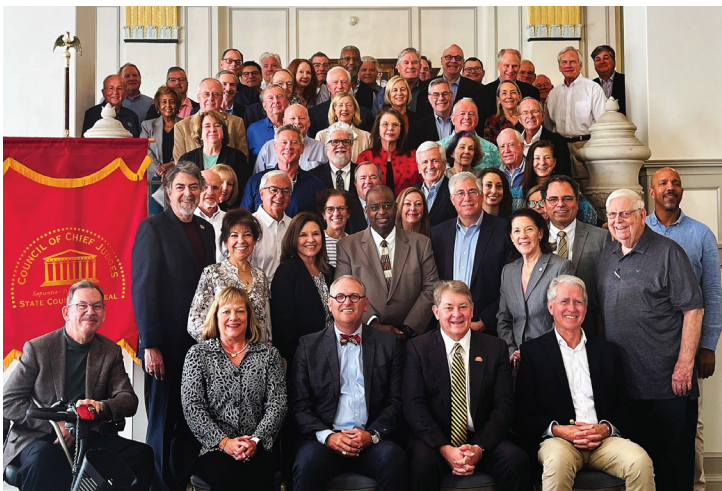
2023 South Carolina Conference Attendees