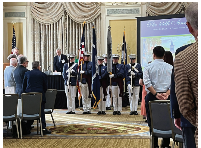
Citadel Honor Guard During Opening Ceremonies