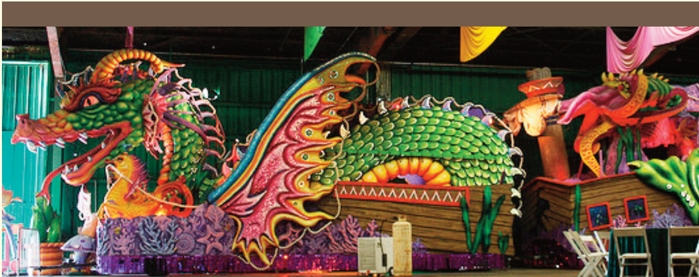
You will be treated to a real, behind-the-scenes look at New Orleans Mardi Gras.