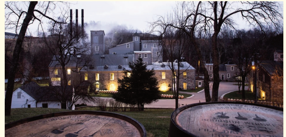
Woodford Reserve Distillery