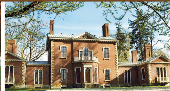
Asbland, home of Henry Clay