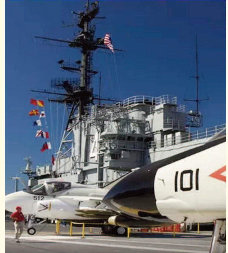
USS Midway Museum - San Diego - Tourism Media Expedia.com