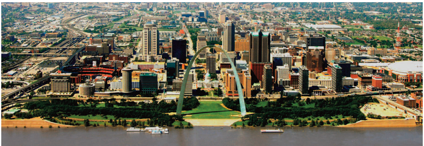
St. Louis skyline from the air looking west.

8:30AM to 10:00AM Executive Committee Meeting Salon I, 2nd Floor Executive Committee Members