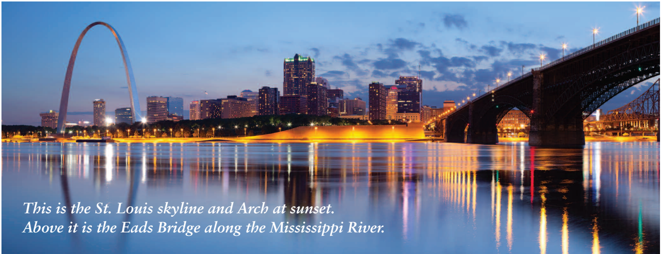
This is the St. Louis skyline and Arch at sunset. Above it is the Eads Bridge along the Mississippi River.

“Meet Me in St. Louis: The Show-Me Conference”