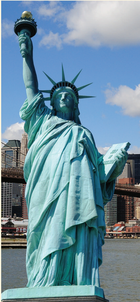
The Statue of Liberty Liberty Island, Manhattan New York City